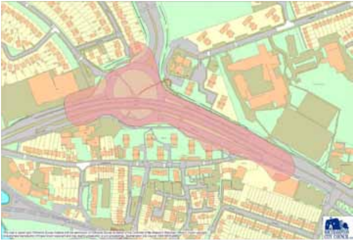
5) Redbridge Road