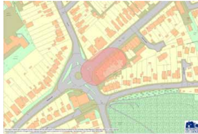
3) Hill Lane, Winchester Road and the Avenue