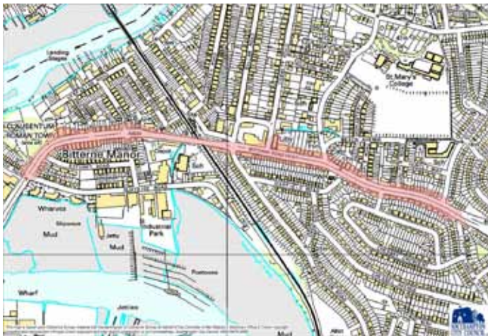
2) Bitterne Road West