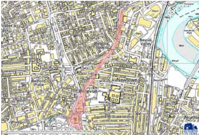
1) Bevois Valley Road