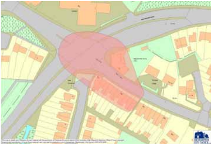
6) Junction of Romsey Road and Winchester Road